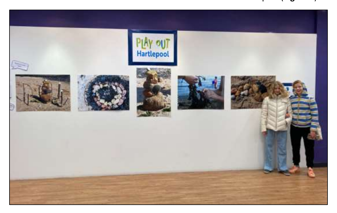
Figure 8 Beach art created by the families on their trip to the beach with Play Out Hartlepool.

A highlight for the children was watching how long the cormorants remained under water after diving for fish. Families also observed some of the local points of interest including the Andy Cap monument and St Hilds. With the help of a local artist everyone worked together to create beach art which was later shared at the Central Hub in Hartlepool ( Figure 8 ).