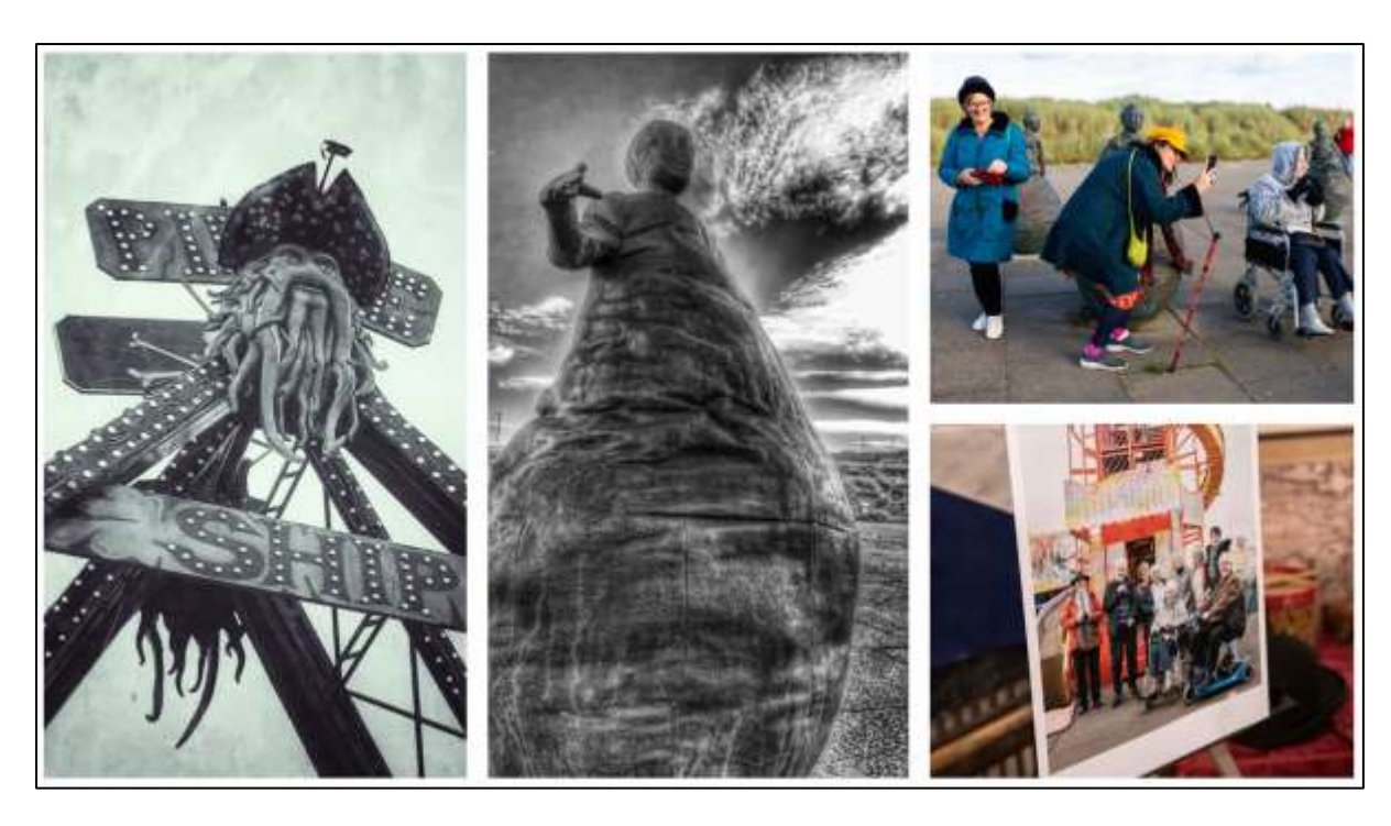
Figure 9 Photographs captured by members of the Banyan Arts group during their visit to South Shields.