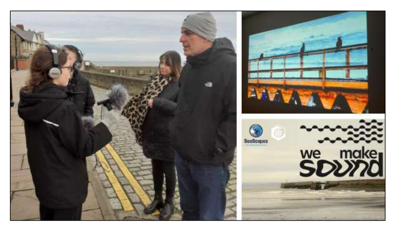
Figure 10 The We Make Sound group collecting sound recordings to produce music/sound tracks.

Organisation: The WHiST (Women's Health in South Tyneside) Webpage: WHIST – Women's Health in South Tyneside