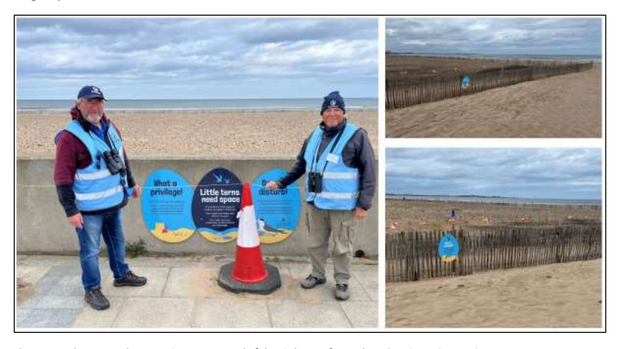
Figure 17 Voluteer wardens carrying out a patorl of the Little Tern fecnced nesting site at Seaton Carew.

Tern the Tide is a group of volunteers passionate about protecting the rare ground nesting Little Terns which for the past three years have chosen the beaches of Seaton Carew as their breeding grounds. Volunteers conducted 24hr patrols of the fenced area to keep the birds safe from disturbance and thus increase the number of successful fledglings before the birds return to Africa (Figure 17). The grant has enabled the group to continue meeting throughout the year to be better prepared for the next season. The group are now in the process of creating a brochure for the public with information about their work and how to age a chick. The purchase of new binoculars not only improved watching efficiency but allowed members of the public to observe the chicks from a safe distance. This year the wardens recorded a total of 154 fledged little terns, of which 117 were ringed for future monitoring, and 28 fledged ringed plovers.