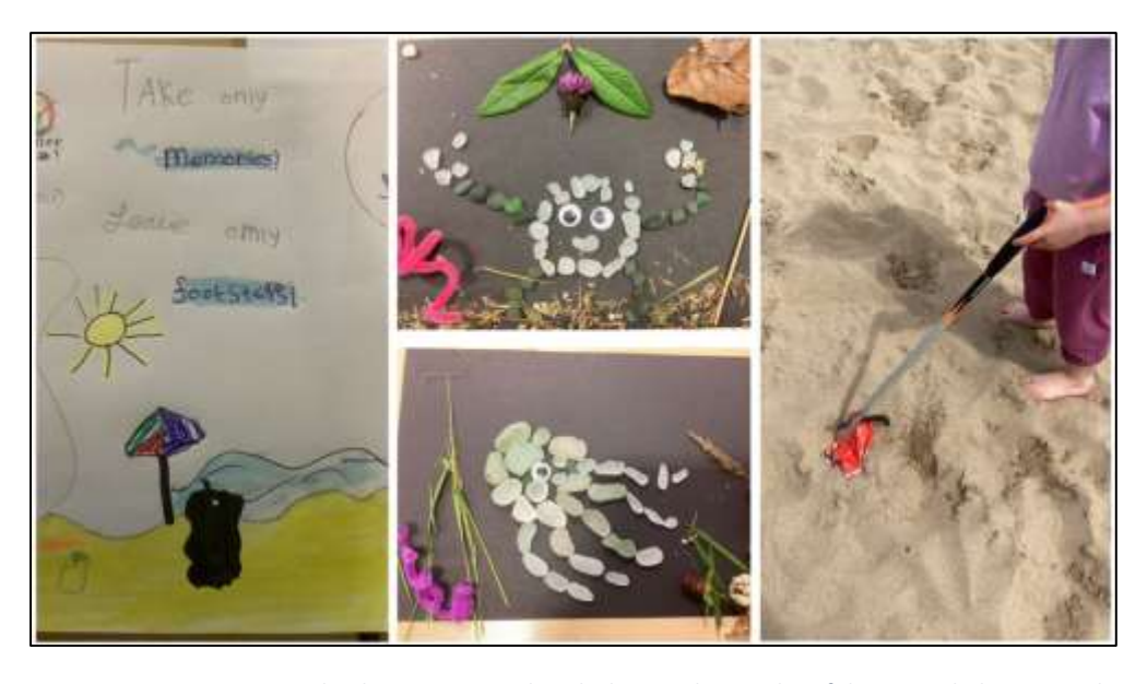
Figure 13 Trinity Primary School carrying out a beach clean and examples of the artwork they created.

During beach visits a key message was 'Take only memories, leave only footprints.' This was demonstrated by making sand art structures with gardening tools, which did not impact local wildlife and would return to normal when the tide came in. Pupils also conducted litter picks to protect local habitats. As a legacy, the year 6 pupils were able to share their findings with the younger pupils who in turn will one day get the opportunity to use the equipment themselves on visits to the beach.