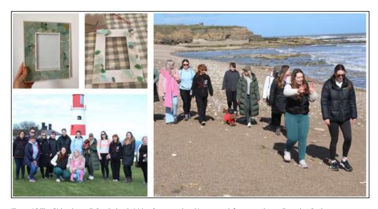
Figure 16 The Girls who walk Sunderland visiting Souter and making artwork from sea glass collected at Seaham.

Girls Who Walk Sunderland provided coastal walks for their community-based group of women. The group uses social activities to inspire, combat isolation and loneliness, and create a safe place for women. The project supported with transport and refreshment costs to help tackle socioeconomic problems which had previously acted as a barrier. Walks along the King Charles III England Coast Path provided the opportunity to overserve local heritage including visiting Souter Lighthouse, exploring the clifftops at Blackhall Rocks, and collecting sea glass at Seaham (Figure 16). Taking part in an open water swim at Roker, Sunderland, reinforced how nature supports healthy mental well-being and has inspired the planning of swimming lessons and future coastal swims. Combined with observing dolphins for the first time on another walk, the group have now become more aware of water pollution concerns and want to get more involved in local beach cleans.