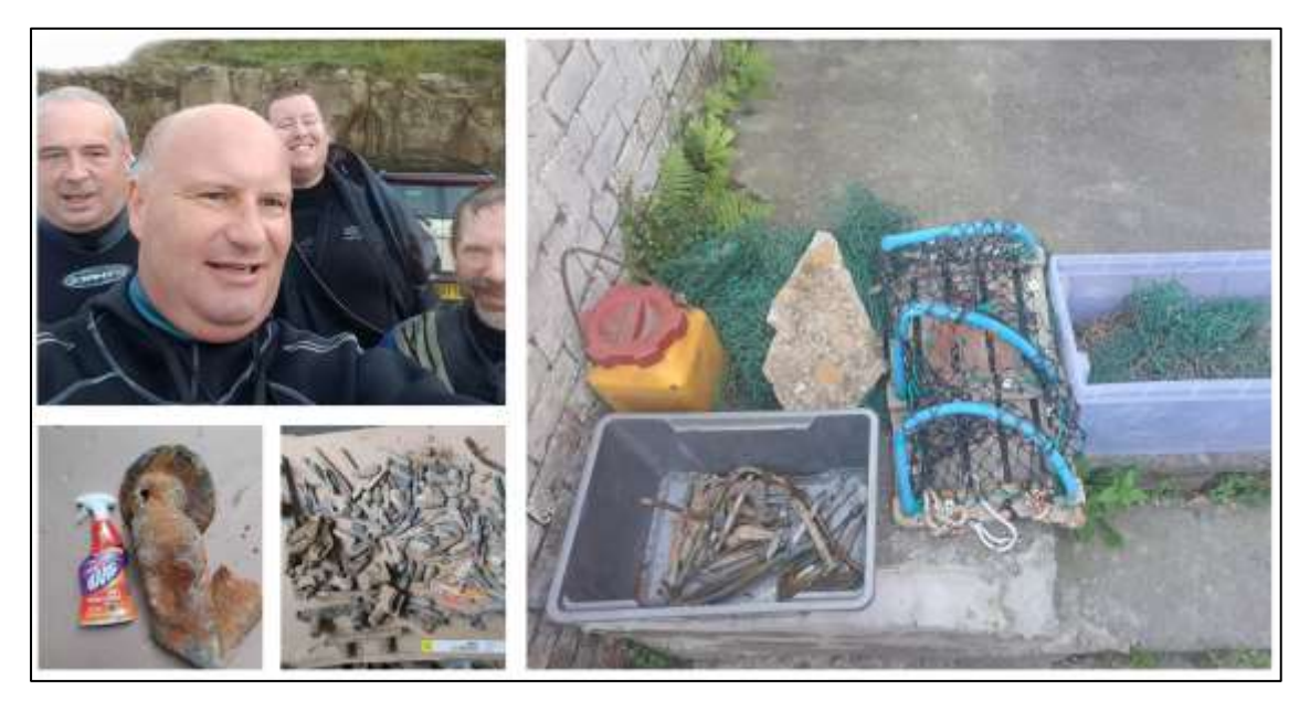
Figure 6 East Durham Divers and examples of the litter collected during clean up dives around Seaham harbour.

The rubbish collected was photographed and shown to members of the public as it was brought to shore ( Figure 6 ). Items collected included plastics, beer/soda cans, ghost netting, a damaged lobster pot, recreational fishing lead weights, and even a coffee machine! In one dive session alone, the dive team retrieved 19kgs of rubbish. Re-cycling was also an important message and when possible, some of the collected material was re-used or will be donated to create art displays.