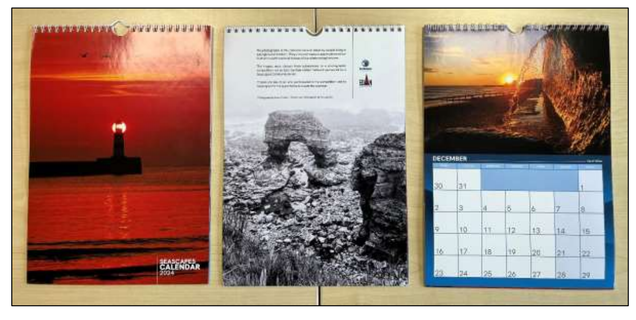
Figure 1 EDAN Seascapes Calendar 2024 celebrating photographs taken by residents from Seaham and Easington.

Twenty winning entrees were selected by a panel of EDAN artists, and these images were mounted and displayed at the EDAN Gallery in July 2023. These images were then shown in the 'Motion 4 the Ocean' exhibition at Seaham Hall in October 2023. A final fourteen were then chosen to create a 2024 calendar to celebrate and promote local hidden heritage ( Figure 1 ).