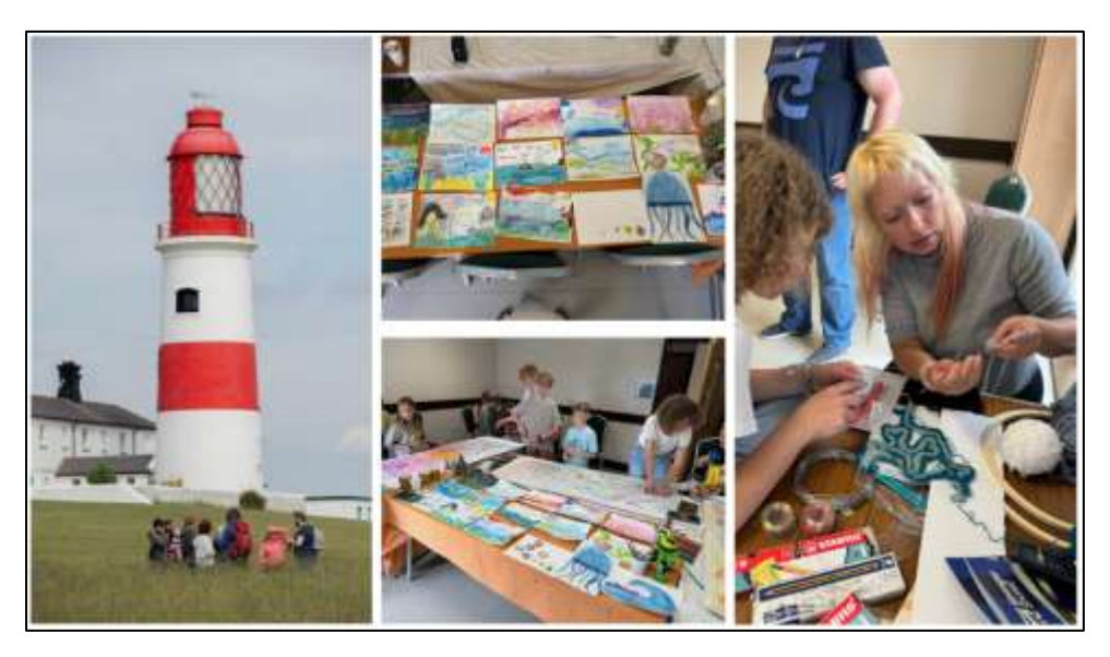
Figure 14 Moving Art Management visit to Souter Lighthouse and participants crafting a personal response to the coastal environment.

The movement element stemmed from connecting with the physical body, the breath, and the senses, then allowing movement to emerge with prompts from the artist as to how to explore themes such as marine animals swimming and waves crashing. The project was also funded by the <a href="National Trust">National Trust</a> which helped deliver green space visits for a comparison to the coast, and by <a href="Stronger Shores">Stronger Shores</a> which focuses on 3 species to prevent coastal erosion. The project will display artwork from the project and deliver a performance at a local exhibition in September 2024.