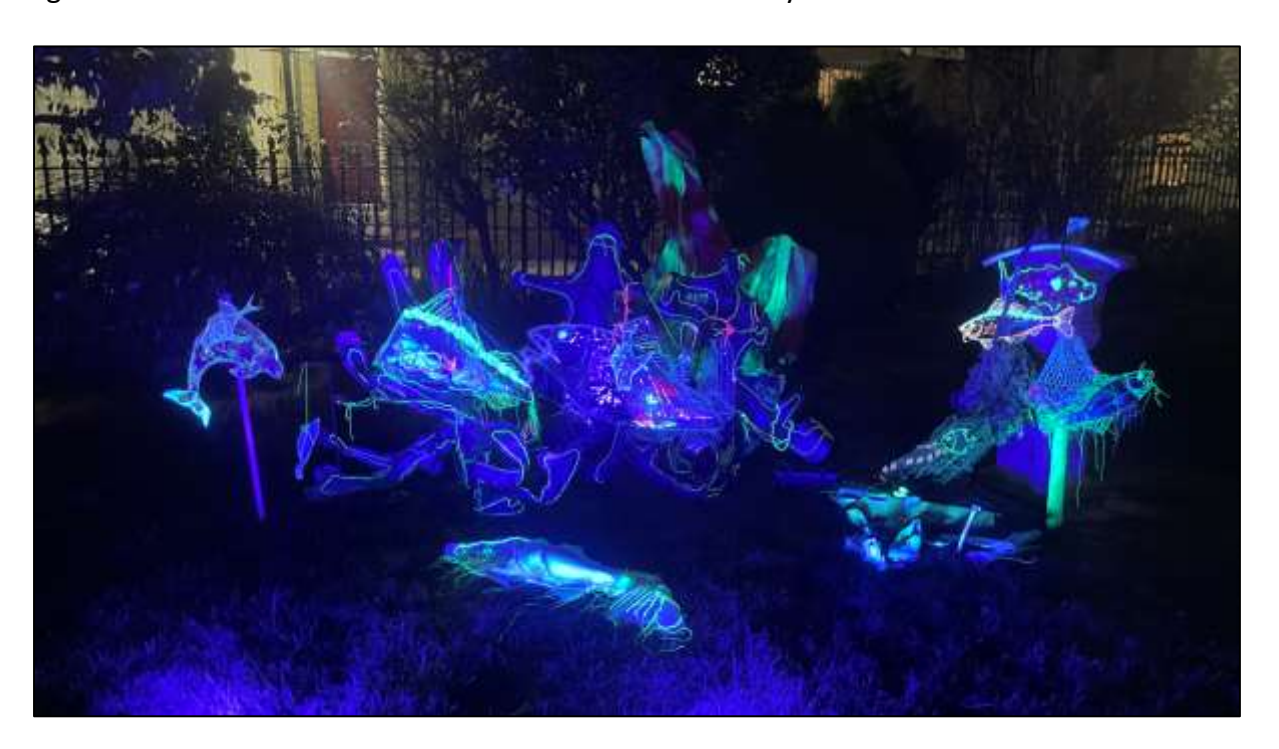
Figure 3 Jack of Hearts - Coral Garden UV Installation as part of the Hartlepool 2023 Wintertide Festival.

Residents also decorated their windows with crochet and yarn sea life displays. Workshops included the gathering of vox pops. One resident said, "Really love how this community can really work together to create art ... we're not even arty!" After the beach clean a participant aged ten said "I feel like I have rescued some wildlife today."