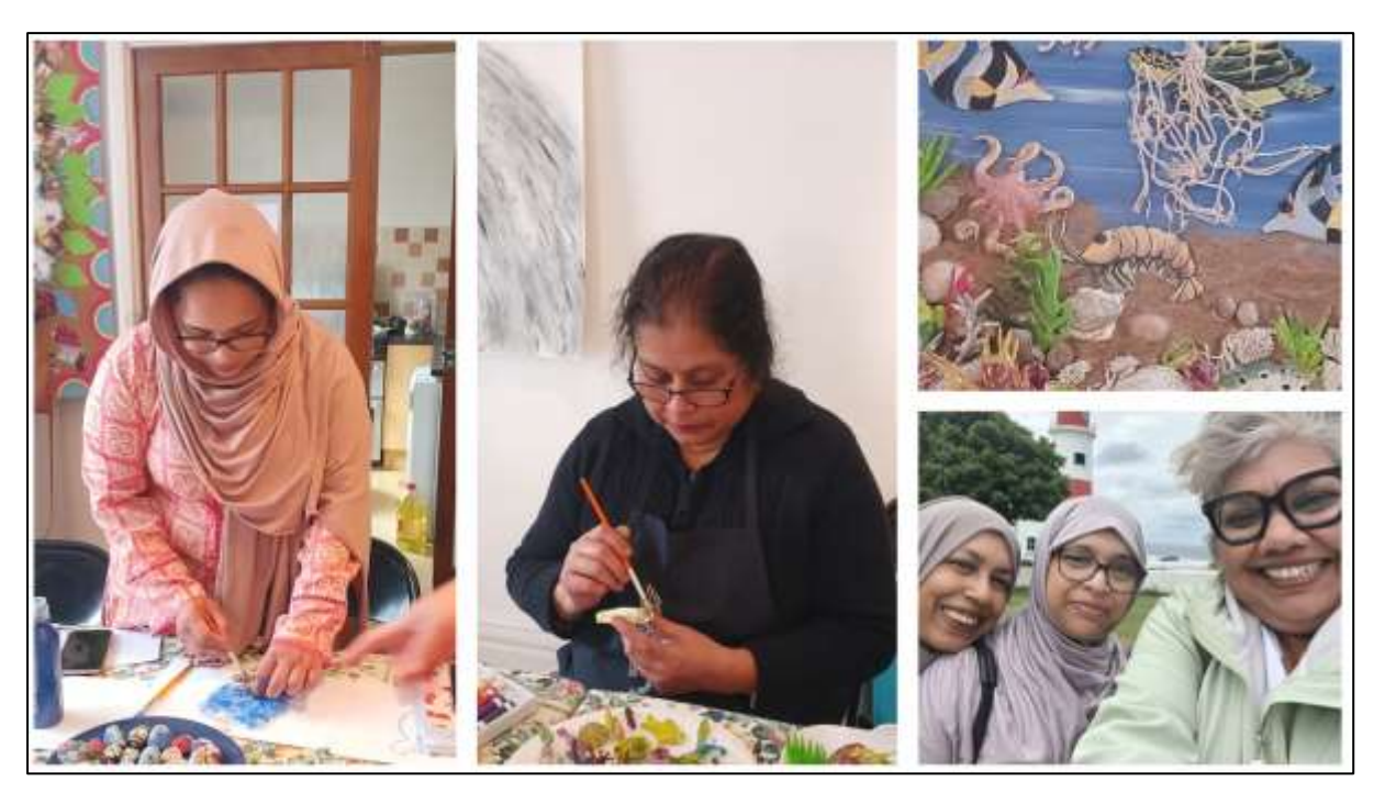
Figure 12 The Sangini group creating art work to compare local and Bangladeshi marine habitas and wildife.

The community has a rich history of coastal heritage and memories from their childhood in Bangladesh but had previously felt they could not share this or engage with the local coast and marine environment. The project enabled the women to create pieces of art to share that represented Bangladeshi coastal habitats and made comparisons on the environmental issues that also threaten local UK marine habitats.