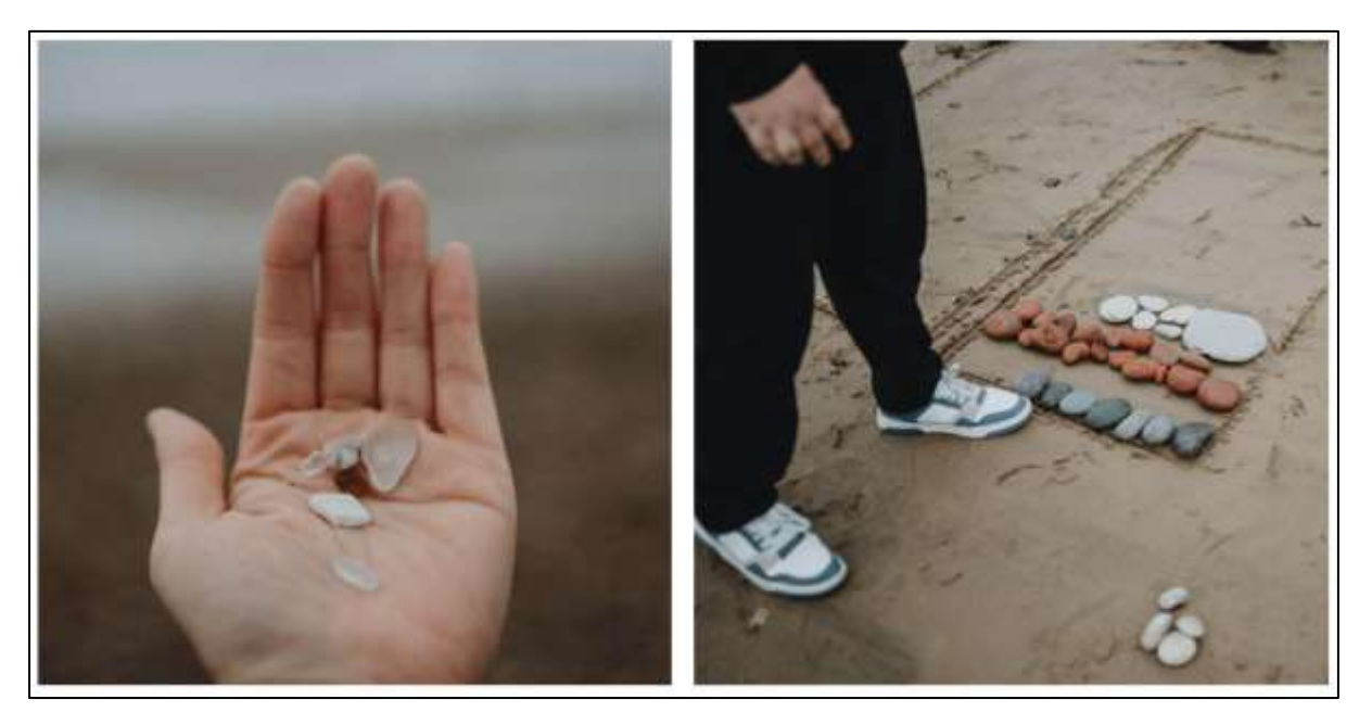
Figure 7 Curious Arts trip to Seaham beach collecting sea glass and creating a pride flag.

Watching the sea inspired discussions to reflect on personal experiences and how the waves can represent the rhythms and struggles of growing up as young LGBTQIA+ people in the Northeast. Participants left with a newfound understanding of their place within their local coast environment and their responsibility to help protect it. The day helped connect young people to one another and to champion LGBTQIA+ communities.