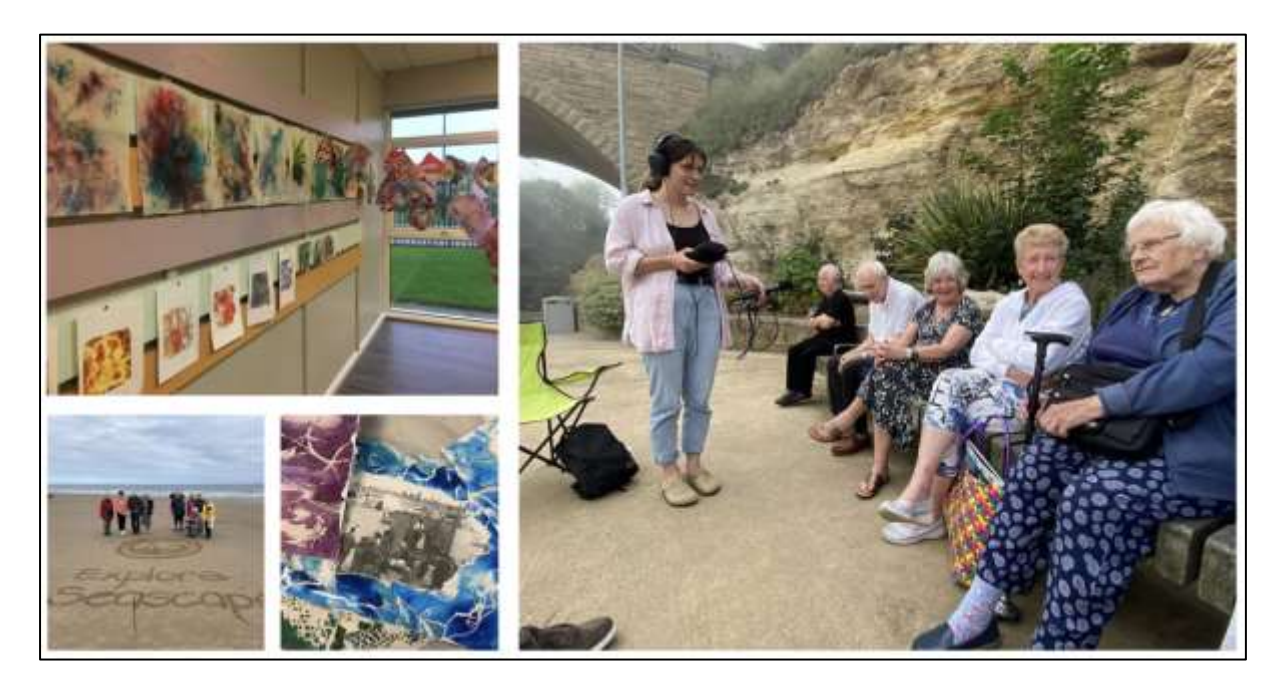
Figure 4 Southwick REACH exhibition at Austin House Family Centre and the members visit to Roker.

On Roker beach everyone was encouraged to be mindful of their surroundings to inspire creativity and raise awareness of the marine environment. A soundscape was produced by a sound recording artists from conversations and storytelling initiated by focusing on coastal sounds. The participants then shared their creations as part of an exhibition at Austin House Family Centre in 2023 (Figure 4).